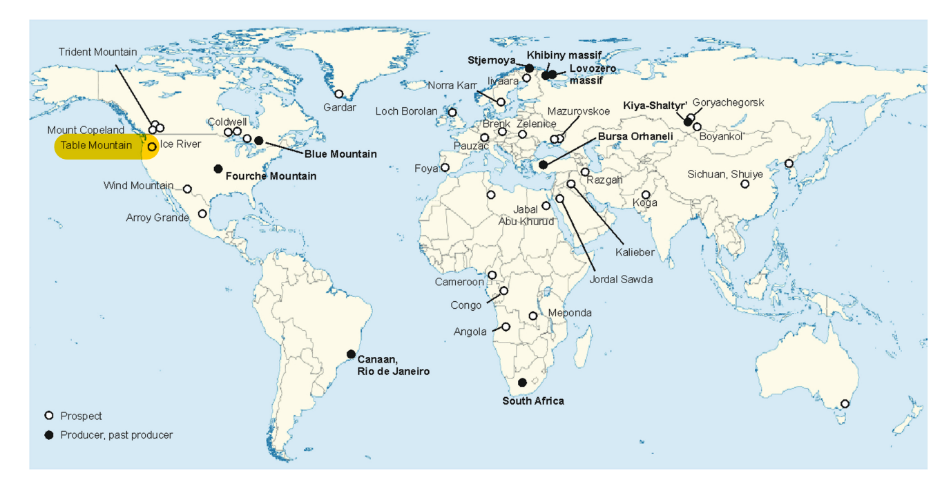
Fig. 1 Nepheline mines and deposits of the world. Adapted from [1]

For many years two large nepheline syenite deposits have been mined in Canada (Blue Mountain) and Norway (Stjernøy) producing high-purity potassium nephelineenriched feldspathic concentrates. The composition of the Blue Mountain nepheline ore is 23% A1<sub>2</sub>O<sub>3</sub>, 60% SiO<sub>2</sub>, and 4% K<sub>2</sub>O. Due to presence of alumina and alkali, nepheline concentrates are used as raw material for production of: (1) Glass (flux to reduce fusion temperature, ensures resistance to scratches and cracks, improved heat resistance, chemical recovery); (2) Ceramics (flux to reduce fusion temperature); (3) Filler in adhesives, paint, plastics, and sealants; (4) Mineral wool (thermal insulation); (5) Building stone, etc.